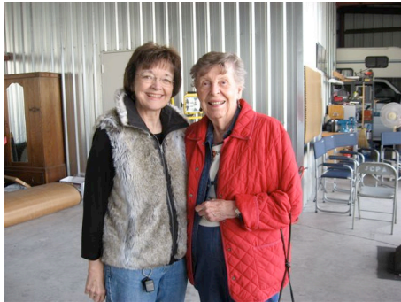
Photos from the barbecue