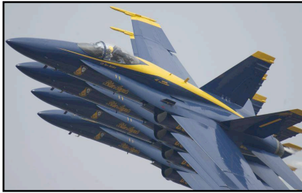
The Blue Angels