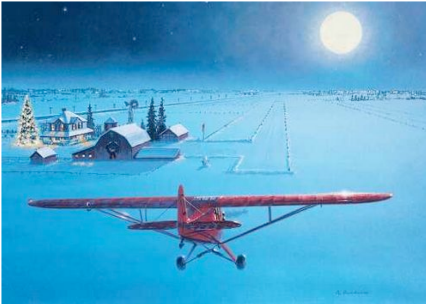
Card available from http://www.holidaycardcenter.org/asf/

This year the Christmas Party will have a different format - a pot luck dinner. The event will be held on Saturday December 6, 2008 at Port Townsend Aircraft Services hangar. Festivities will begin with a social hour at 6 pm, followed by dinner at 7 pm.