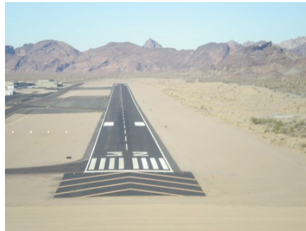
Short final, Lake Havasu, AZ

The JCPA meets at 1000 on the first Saturday of each month in the pilots lounge at Port Townsend Aircraft Services, 191 Airport Road, Port Townsend, WA 98368. In addition to the regular meetings, fly-outs and other events are scheduled from time-to-time. For more, visit JeffcoPilots.com .