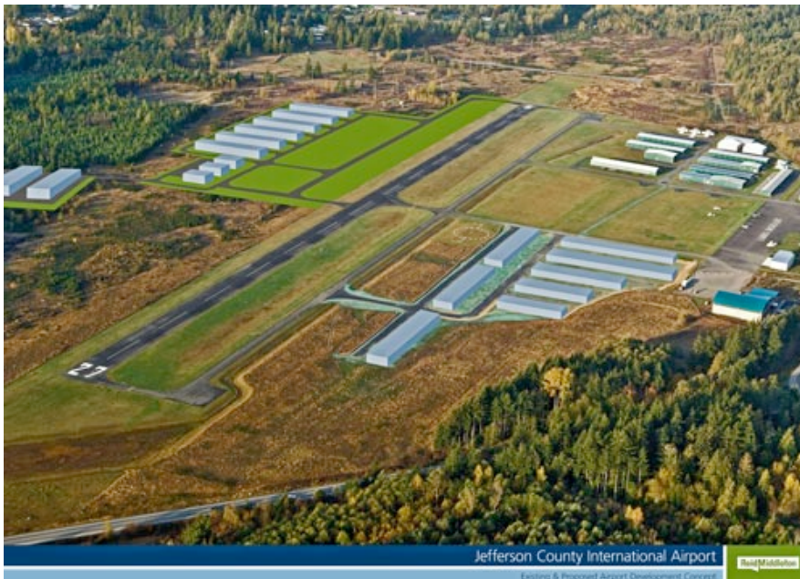
Planned development at Jefferson County International Airport - Pending FAA approval.