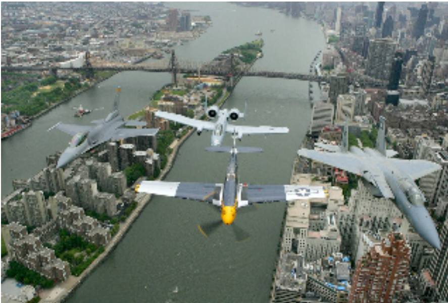
Over the East River in New York City.