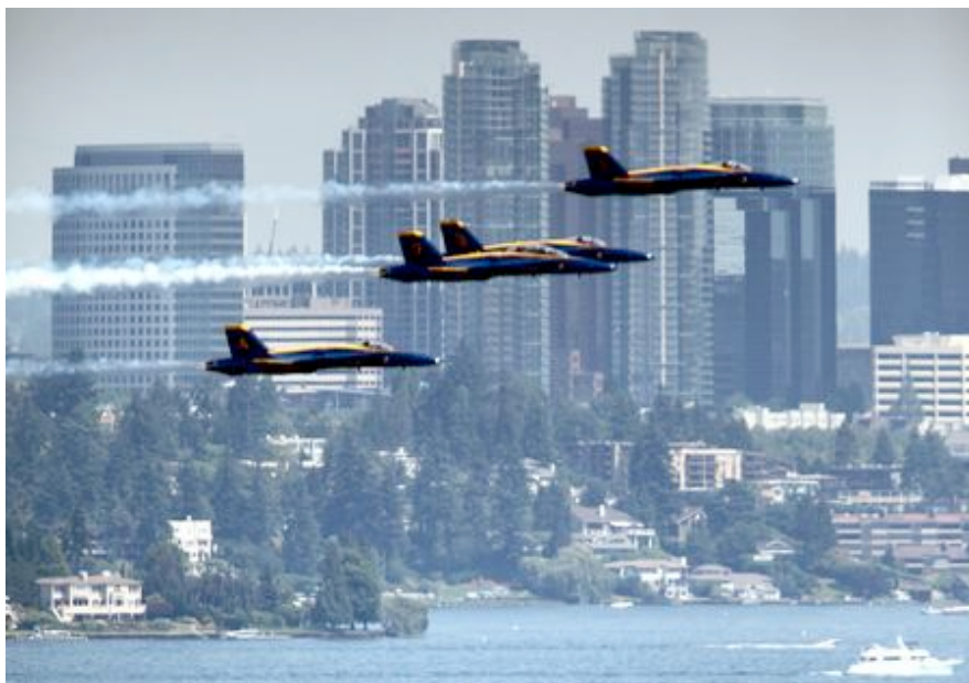
Blue Angels Over Lake Washington. Seafair 2009.

The JCPA meets at 1000 on the first Saturday of each month in the pilots lounge at Port Townsend Aircraft Services, 191 Airport Road, Port Townsend, WA 98368. For more, visit JeffcoPilots.com .