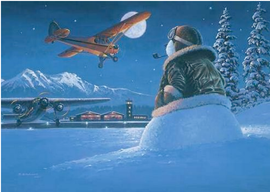
AOPA Air Safety Foundation Card

Join your fellow pilots at the celebration.