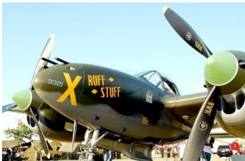
The P-38 "Ruff Stuff" at AirVenture 2009 - Image by Gary Dikkers.