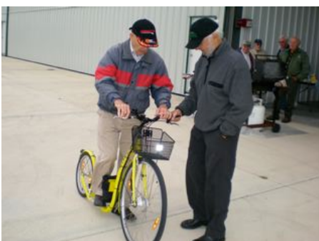
Mort says, "Bring me your log book."