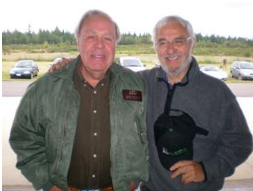
The weather was a little cool, but nobody seemed to mind.