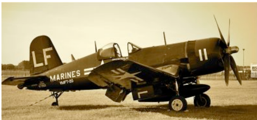
Chance Vought F4U "Corsair" at Oshkosh.