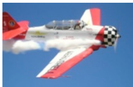
Texan - low pass.