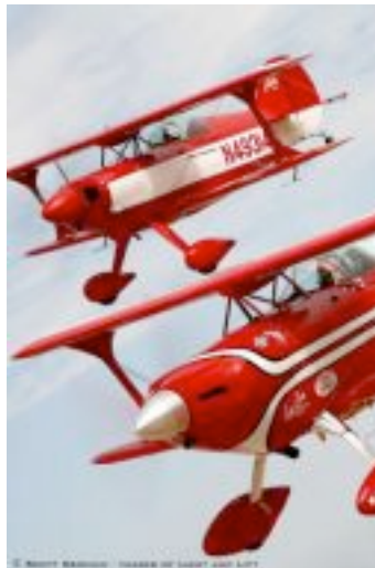
Pair of Pitts.