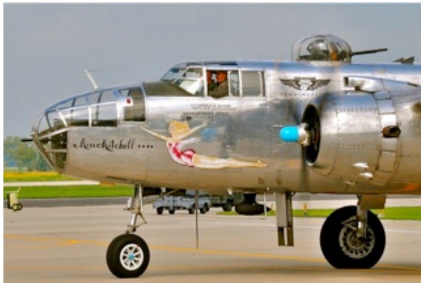
Nose art on the B-25J "Miss Mitchell."