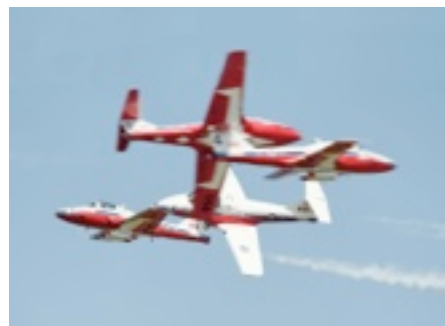
Snowbirds - timing is everything.